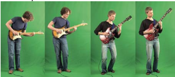
Figure 1. Still images taken from our filmed guitar performances. Note the weight shifts and the head movements.

The electric guitar is traditionally related to popular music styles such as jazz and rock where there is a social acceptance and even expectation for an engaged performance body [5]. Embodied expression and rhythm are part of the guitar playing tradition. The sound-accompanying movements being thus relatively emphasized, the electric guitar provides for a fertile testing ground for our project. In order to analyze the different movements of electric guitar performance in standing position, we first set out to review video excerpts from a number of players. Subsequently we filmed a series of performances in laboratory conditions, allowing for a finer analysis of the players' movements and their relationships to the instrument and to each other.