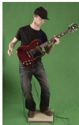
Figure 3. A still image from the filmed test sessions with the sensor board and head accelerometer

The possibilities are numerous, and the system may be adapted to any instrument using digital signal processing. A case-specific study of the instrument's characteristic ancillary gestures is nevertheless necessary 1 .